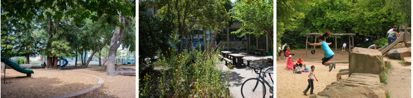
The trees here provide shade for students while they are outside playing and the natural materials like rocks and wood allow more creative and adventurous play.