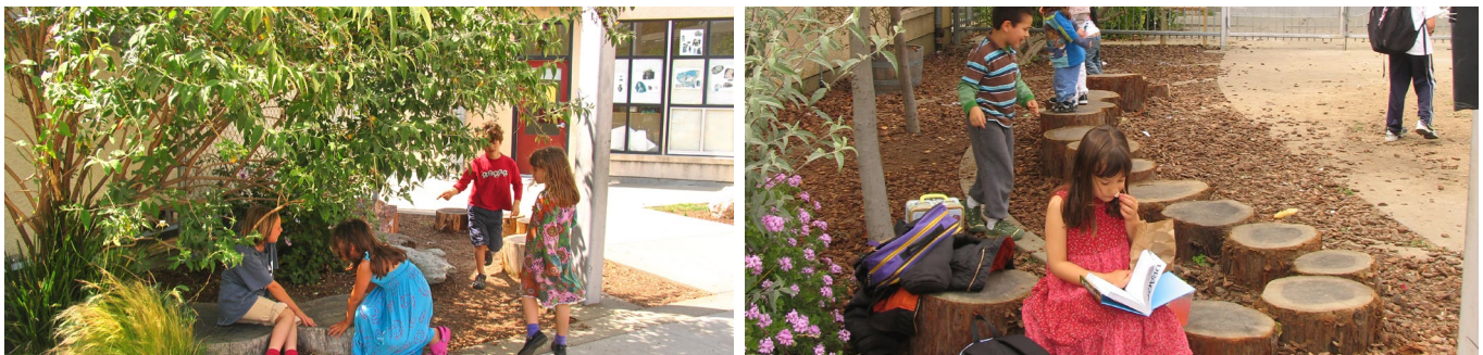
The elements in these photos provide opportunities for students to hang out quietly with a friend, calm down on a difficult day, or just have some down time.