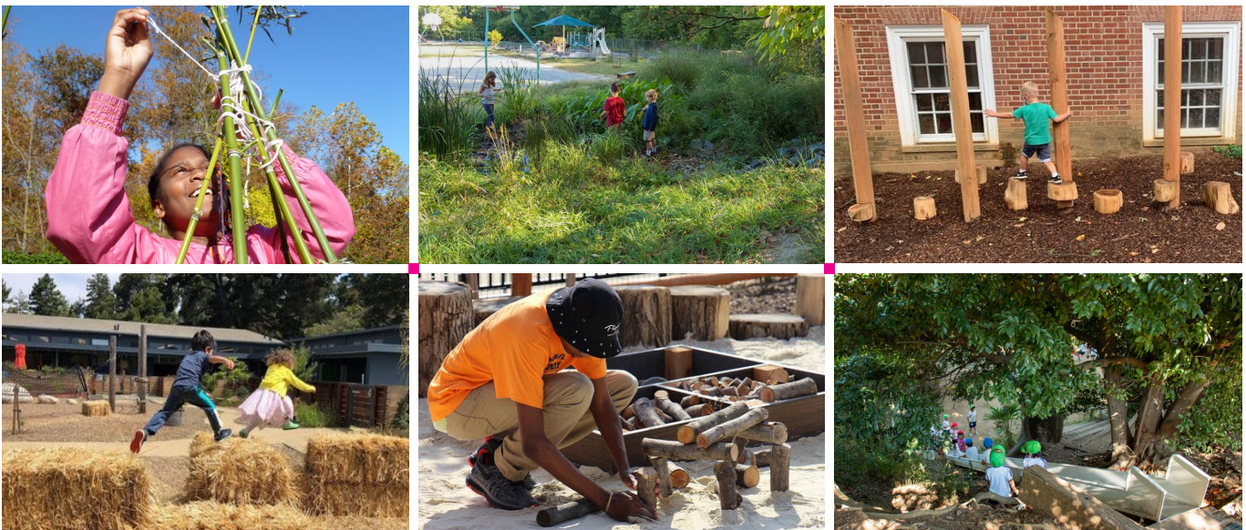
The elements in these photos provide opportunities for students to work together and engage with the natural world.